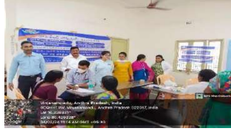
Vinjanampadu, Andhra Pradesh, India 6CQC+FW, Vinjanampadu, Andhra Pradesh 522017, India Lat 16.23849° Long 80.42954° 04/02/24 11:54 AM GMT +05:30