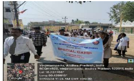
Vinjanampadu, Andhra Pradesh, India 6CQH+Q22, Vinjanampadu, Andhra Pradesh 522017, India Lat 16.237769° Long 80.426915° 07/02/24 11:24 AM GMT +05:30