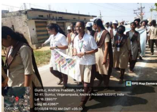
Guntur, Andhra Pradesh, India 12-41, Guntur, Vinjanampadu, Andhra Pradesh 522017, India Lat 16.239071° Long 80.42667° 07/02/24 11:22 AM GMT +05:30