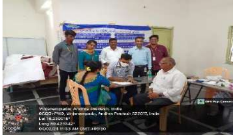
Vinjanampadu, Andhra Pradesh, India 6CQC+FW, Vinjanampadu, Andhra Pradesh 522017, India Lat 16.23849° Long 80.42954° 04/02/24 11:52 AM GMT +05:30