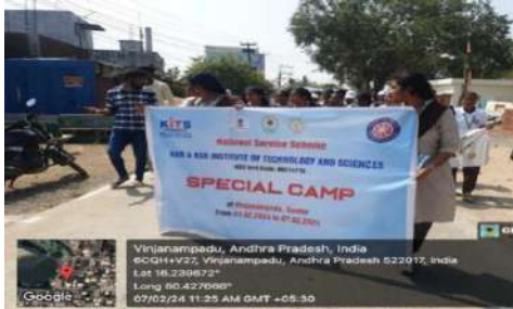
Vinjanampadu, Andhra Pradesh, India 6CQH+VZ5, Vinjanampadu, Andhra Pradesh 522017, India Lat 16.239923° Long 80.427668° 07/02/24 11:25 AM GMT +05:30