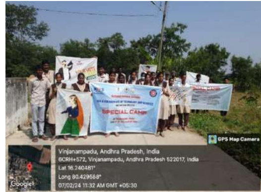
Vinjanampadu, Andhra Pradesh, India 6CRH+572, Vinjanampadu, Andhra Pradesh 522017, India Lat 16.240481° Long 80.429568° 07/02/24 11:32 AM GMT +05:30