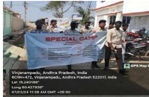
Vinjanampadu, Andhra Pradesh, India 6CRH+472, Vinjanampadu, Andhra Pradesh 522017, India Lat 16.240188° Long 80.427939° 07/02/24 11:26 AM GMT +05:30