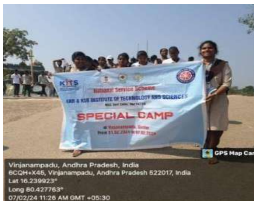
Vinjanampadu, Andhra Pradesh, India 6CQH+X45, Vinjanampadu, Andhra Pradesh 522017, India Lat 16.239923° Long 80.427763° 07/02/24 11:26 AM GMT +05:30