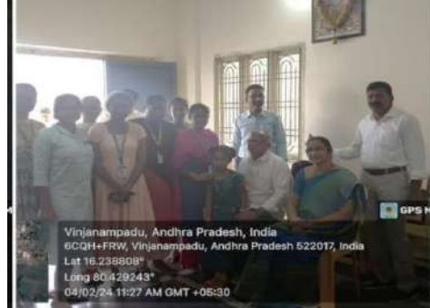
Vinjanampadu, Andhra Pradesh, India 6CQC+FW, Vinjanampadu, Andhra Pradesh 522017, India Lat 16.238808° Long 80.429243° 04/02/24 11:27 AM GMT +05:30