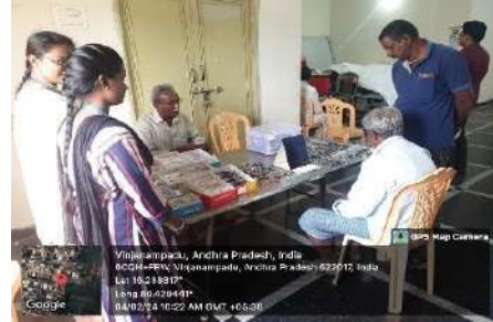
Vinjanampadu, Andhra Pradesh, India 6CQC+FW, Vinjanampadu, Andhra Pradesh 522017, India Lat 16.23849° Long 80.42954° 04/02/24 10:22 AM GMT +05:30