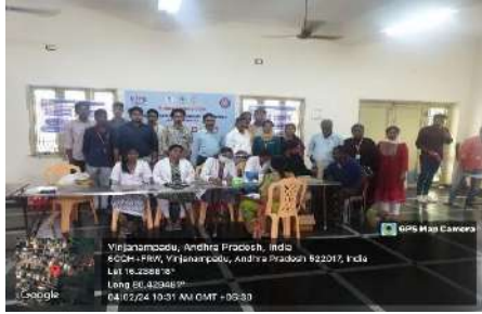
Vinjanampadu, Andhra Pradesh, India 6CQC+FW, Vinjanampadu, Andhra Pradesh 522017, India Lat 16.23849° Long 80.42954° 04/02/24 10:31 AM GMT +05:30