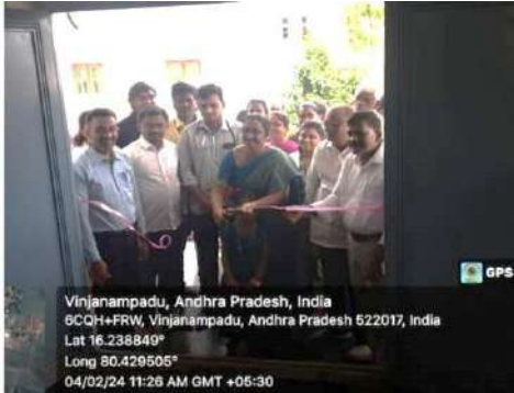
Vinjanampadu, Andhra Pradesh, India 6CQC+FW, Vinjanampadu, Andhra Pradesh 522017, India Lat 16.23849° Long 80.429505° 04/02/24 11:26 AM GMT +05:30